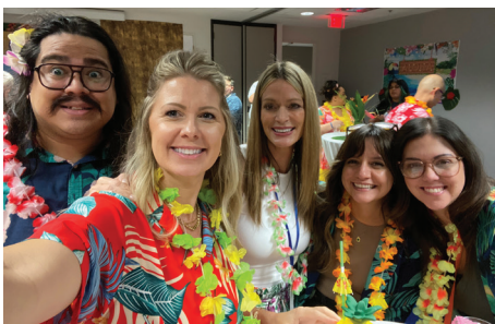
Staff at the Shaping our Future Conference

With our state-wide charter and expanded footprint in Western Arizona, the leadership team spent several months performing a SWOT Analysis – reviewing market data and surveying our members – to ensure we have the right mix of accounts and services and understand growth opportunities in the state. As a result, we introduced new high-yield savings and CD accounts and free checking for existing and new members.