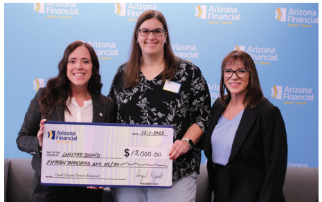
United Sound, Local Causes grant recipient.

In addition to our Local Causes program, we awarded a combined total of $87,550 to Arizona Humane Society and